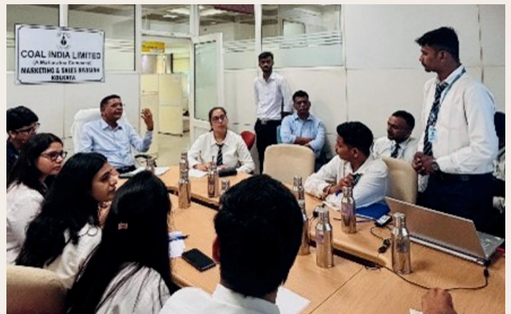
Industrial Visit of students of Marketing Management - Batch 2024-26 (Kolkata)